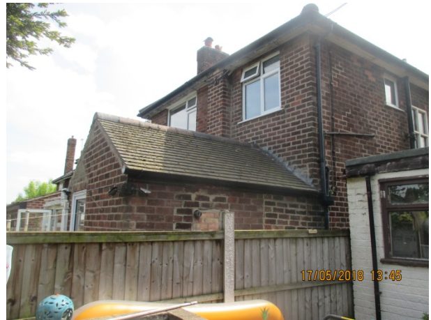
Looking south towards no. 7.