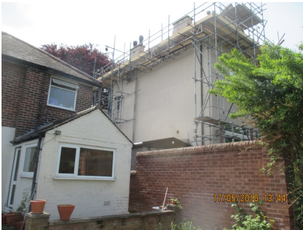
Looking west towards no. 3.