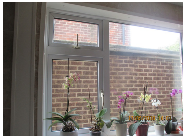
Looking north west from no. 7's kitchen window towards existing side garage of application property.