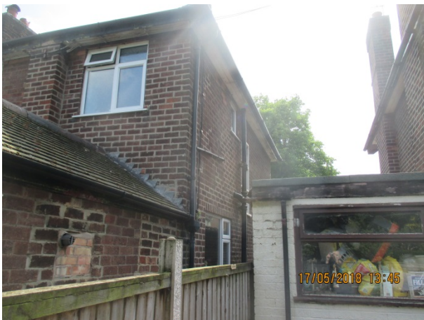
Looking south west towards boundary with no. 7.