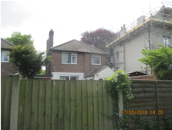
Looking south west from garden of no. 1 Coventry Road towards rear of application property.